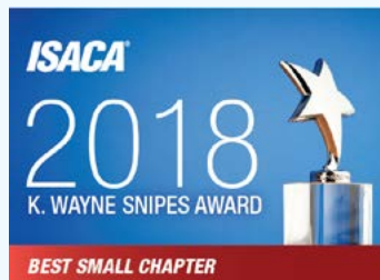
Small: ISACA Curacao Chapter