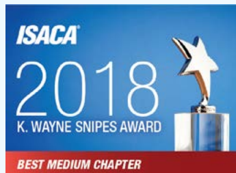
Medium: ISACA Sacramento Chapter