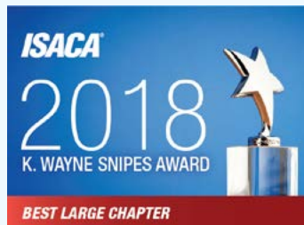
Large: ISACA Vancouver Chapter